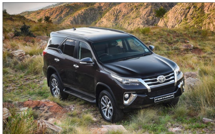
The Toyota Fortuner was a clear winner in the SUV category in SA in 2019. It sold 11 644 units compared to 6 928 units sold by the runner-up, the new Toyota RAV4.