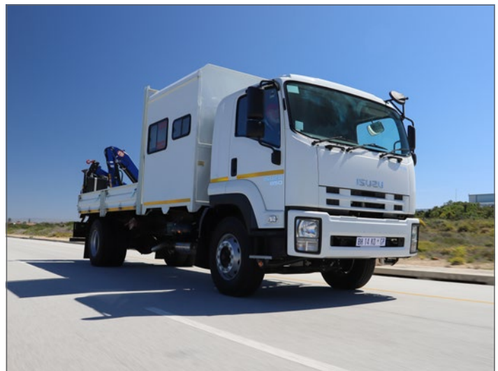
Isuzu was the top selling truck in the heavy commercial vehicle market for the sixth year in succession.