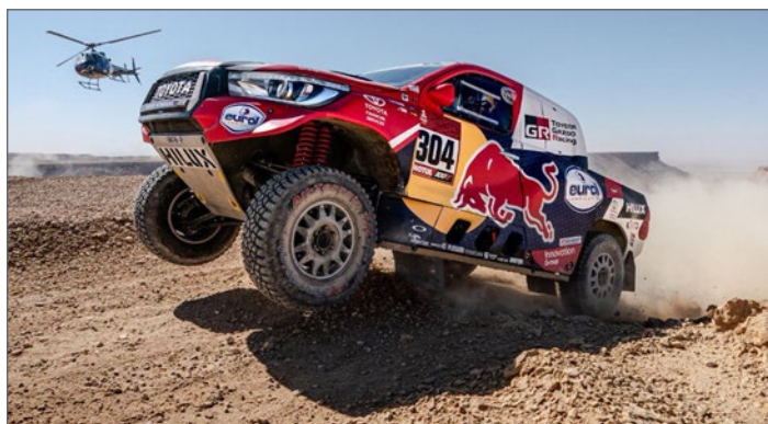
This Toyota model also enjoyed massive global and local exposure as the new year started with another successful foray into the Dakar Rally, which was held in Saudi Arabia for the first time. Hilux had to be satisfied with runner-up position this time, after winning the 2019 event.