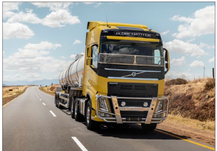
Volvo was the top-seller in the extra heavy truck market in SA in 2019. It had been third in this very competitive market at the end of 2018, but enjoyed a 4.8% increase in market share in 2019 to end with a 23.2% penetration and top spot.