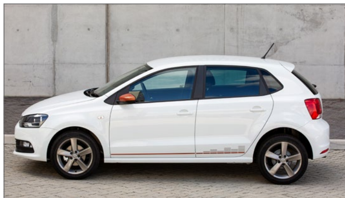
The Polo Vivo was the best selling passenger car in South Africa once again in 2019, selling 29 619 units and making a big contribution to Volkswagen continuing its dominance of the local car market. The car pictured is a Sound special edition.